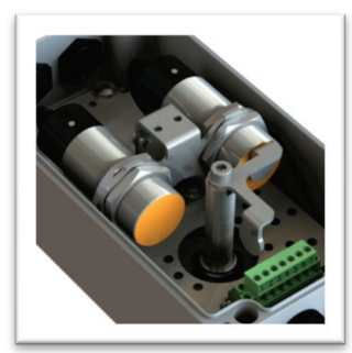
Abb. 2: Standard terminal block

Wire cross section: 0,2 - 2,5mm2 (single-wire inflexible) / 0,25 - 2,5mm2 (single-wire flexible or with ferrule) Stripping length: 7mm Tightening torque: 0,5 - 0,6 Nm