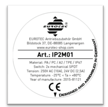
Fig. 1: Labeling

The product label on the housing is shown in figure 1. Each switch type has it's own label. The serial number is to be found above the CE symbol. It contains the year of manufacture and the referring production number.